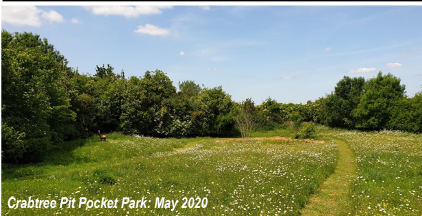
Crabtree Pit Pocket Park: May 2020

Coton Manor has now opened the nursery but NOT the garden and the Tea Room is available for take-away teas, coffees and cakes along with cold savoury snacks. Plant deliveries are still available to the most vulnerable and those shielded, and a 'click and collect' service for those not wishing to socialise yet. Contact nursery@cotonmanor.co.uk for a comprehensive plant list.