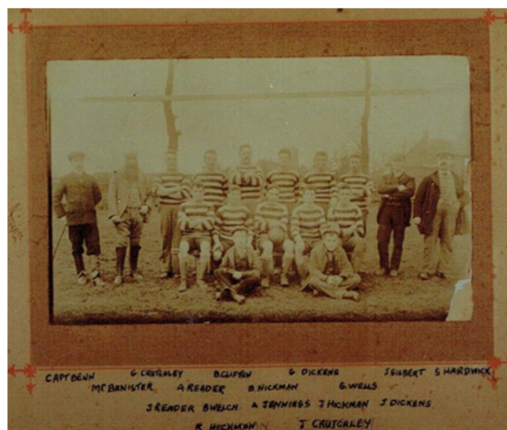
Ravensthorpe Football Club 1897

www.rvhall.online ; email: contact@rvhall.online ; www.facebook.com/RVHall